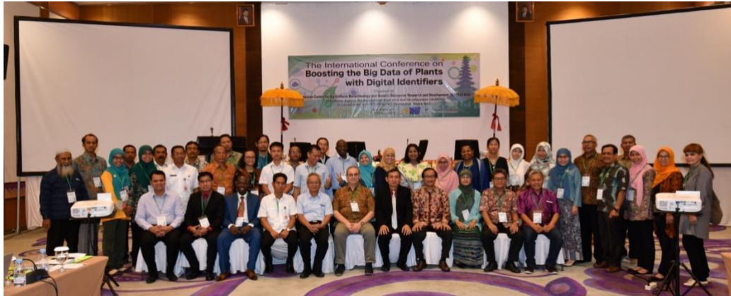
Fig.1. Group picture of the participants of the conference

The whole presentation during the workshop was documented in the institutional repository. There were 35 papers presented during the workshop. The manuscripts were expected to be published as proceedings, and the review is ongoing. The draft is attached separately in the technical report.